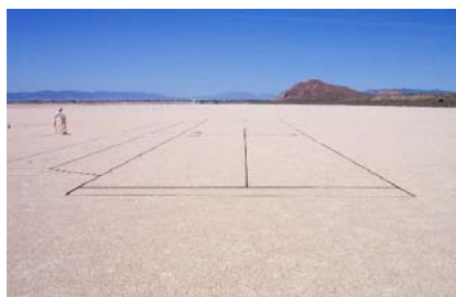
The final product